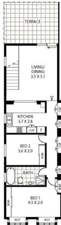
TOP FLOOR APARTMENT